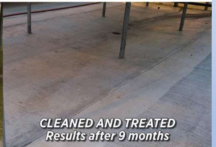
CLEANED AND TREATED Results after 9 months