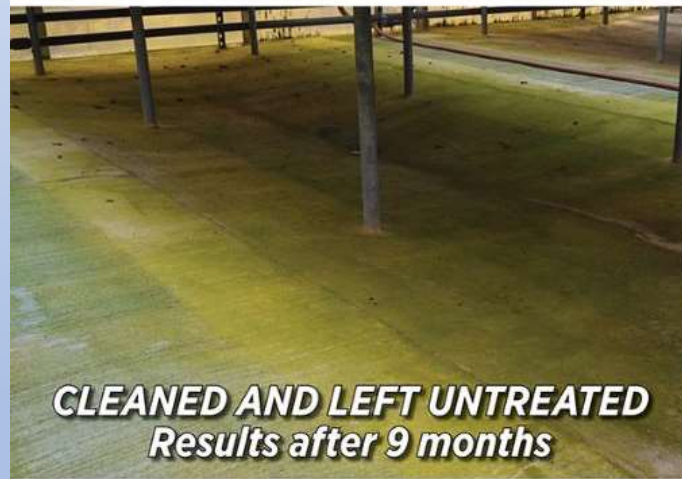
CLEANED AND LEFT UNTREATED Results after 9 months